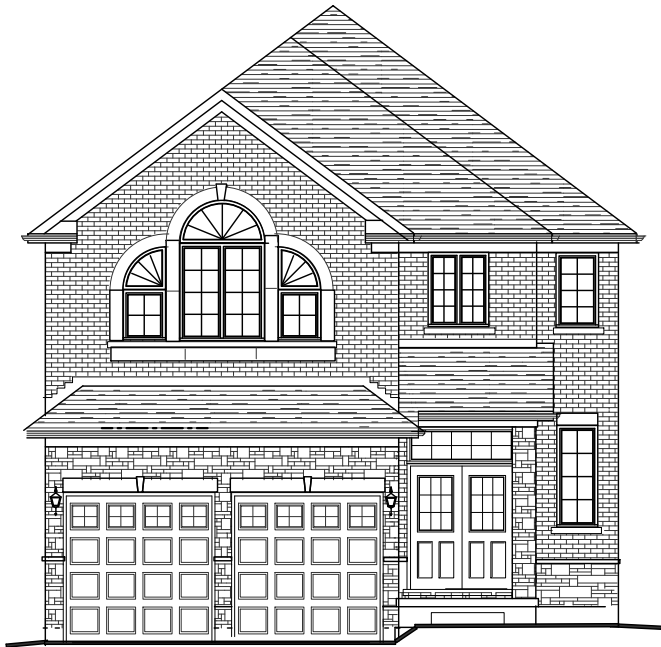
MICHELANGELO ELEV. A